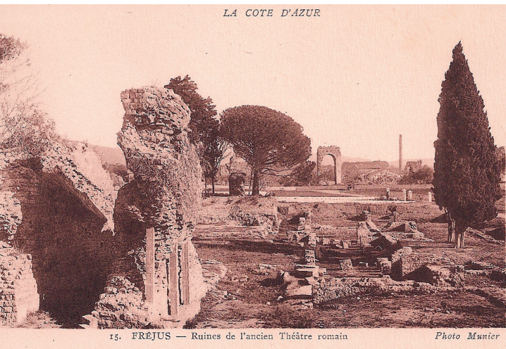
15. FRÉJUS — Ruines de l'ancien Théâtre romain